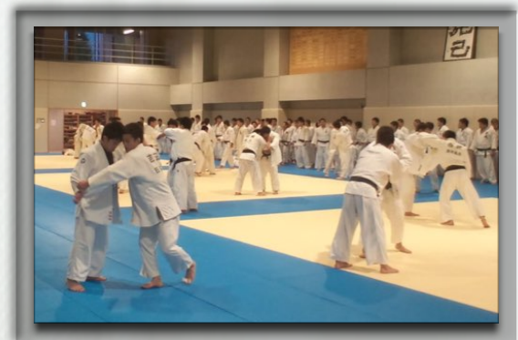
Nihon Tai-iku University