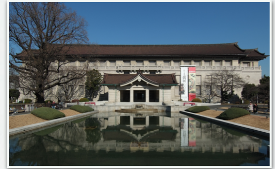
Tokyo National Museum