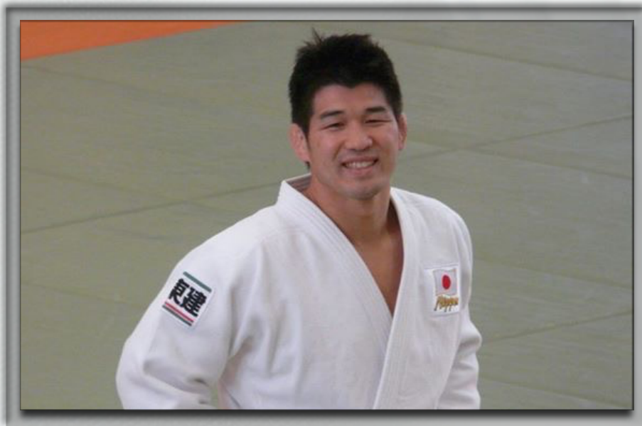
Kosei Inoue Sensei